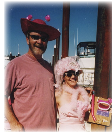
Pink Snorkel Award

Members often cruise together in the San Juan and Gulf Islands.