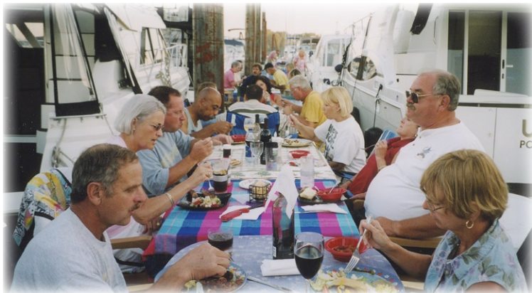
Dinner on the Dock

On cruises, we'll help you get in and out and make sure you have space at the dock.